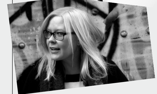
Barcelona, 2015