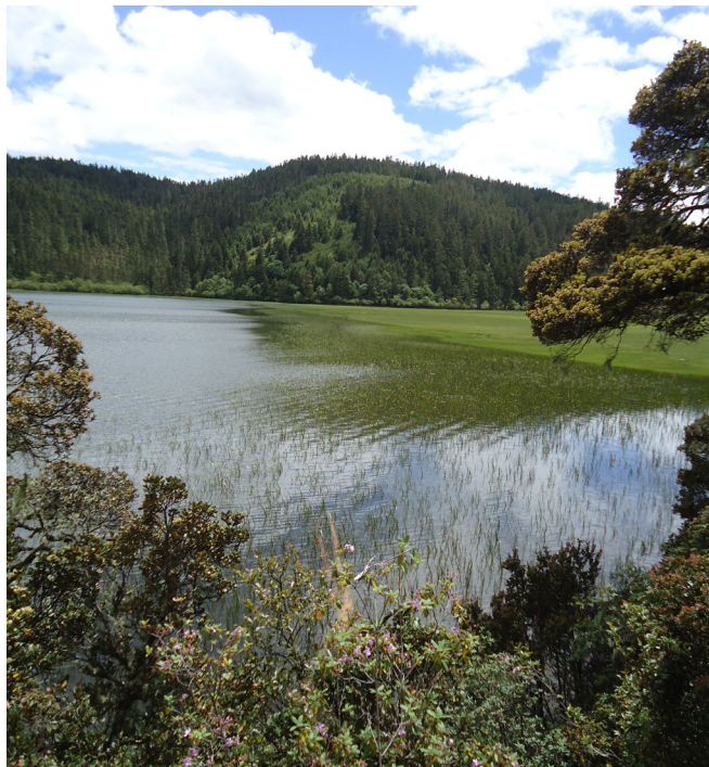
Biya Hai Lake (11,482' above sea level), Pudacuo National Park, Yunnan Province, China; A Wetland of International Importance.

Established in Ramsar, Iran in 1971, the Ramsar Convention, formally known as, “The Convention on Wetlands of International Importance especially as Waterfowl Habitats”, is an intergovernmental treaty. As the first modern, global, nature conservation convention and the only international agreement addressing a particular ecosystem, Ramsar is an international network that addresses wetland conservation on a transnational scale and in an ecocentric manner. The Convention has widespread international support, at this time 160 countries have ratified the treaty.