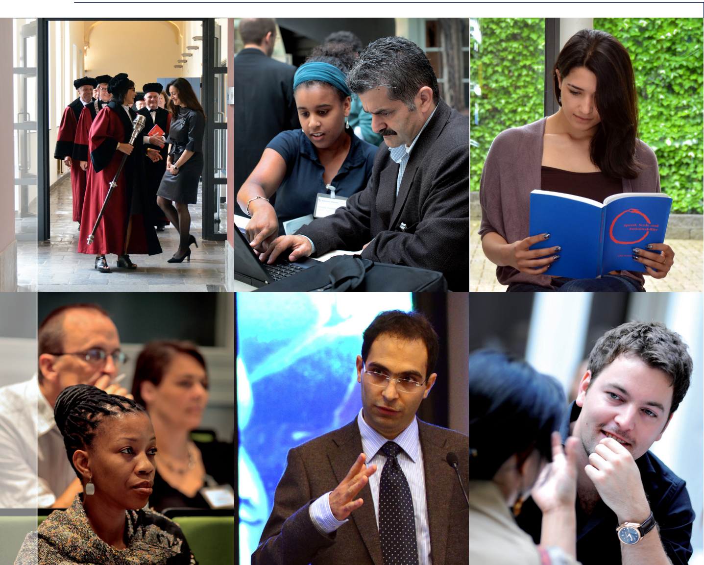
UNU-MERIT | MGSOG | | Concept and design template: Vormgeversassociatie BV/Hoog-Koppell Although this brochure was made with the utmost care, no rights can be obtained from it.