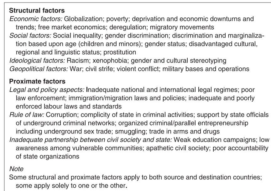
Figure 1.1 Examples of structural and proximate factors involved in trafficking

Specific research questions focus on the relationship between structural and proximate factors that deepens understanding of trafficking (fig. 1.1); the socio-economic context of trafficking, including underdevelopment, poverty, sudden market fluctuations and economic downturns; trafficking