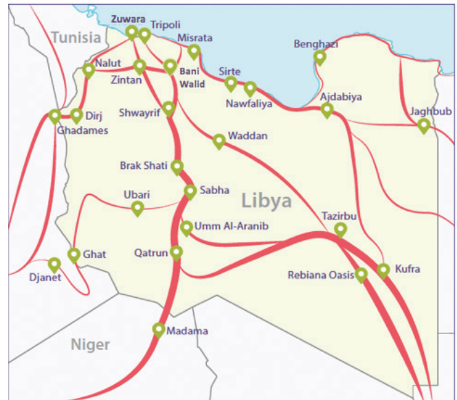
Figure 1: Major smuggling routes and hubs across Libya

In Libya, there are very few genuine national actors – i.e. those with a remit that can command beyond their immediate regions. The vast majority are local players with interests that are either geographic or ethnic, who seek representation and influence in the centre. 35 This meant that from the