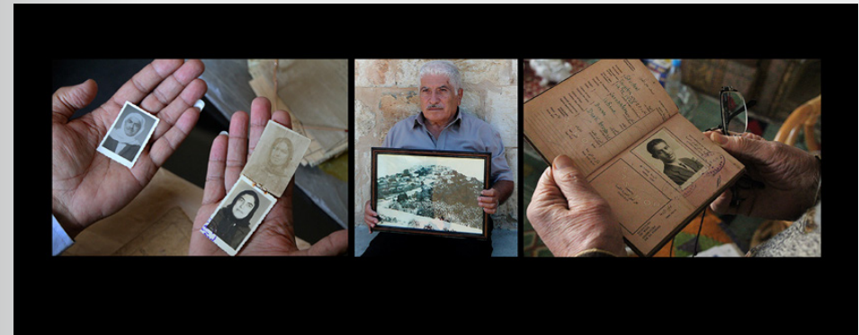
From the series Portraits of Denial & Desire (Hands of Time) , 2013, 60, 96 x 91, 44 cm, Digital Print, Artist Proof