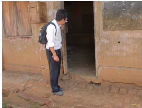
Figure 2 Empty classroom

Ugandan primary schools have faced several challenges. Through the observations of the schools and pupils, I realized that apparently, the facilities are not enough. Due to the shortage of classrooms, more than 100 pupils use one room and the only one teacher has to handle them. In Primary School A, its limited capacity prevented 125 pupils of Grade 4 from being divided into several classes.