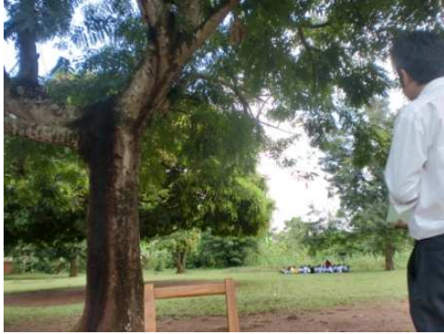
Figure 3 Lesson under a tree

One of the challenges uncovered by this study is relevant to a limited fund to set up an adequate environment for training. Generally, classrooms are not sufficient in both number and quality. Sometimes, pupils have to sit down on the floor. One of the schools I visited had a temporary building with the roof only, I saw that the pupils were taught under a big tree (see figure 3).