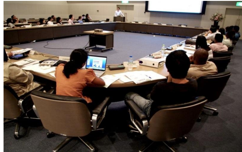
Class at UNU