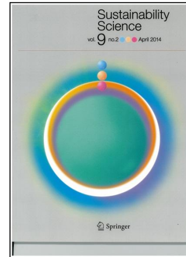
Sustainability Science Journal (SSJ)