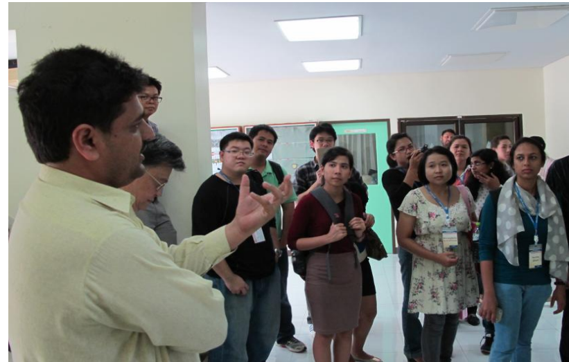
ProSPER.Net Young Researchers' School (Shanghai, 2014)